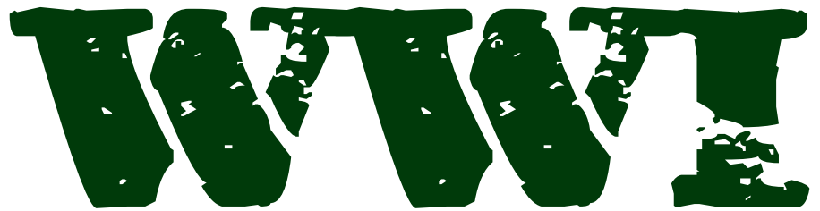
Exhibit Commemorates Arizona & The Great War

Slated to open in March, the Museum's newest exhibit Arizona and the Great War highlights the centenary of Arizona's involvement in World War I, from 1917-1919. Artifacts and stories from Prescott and Yavapai County will be featured in the various displays.