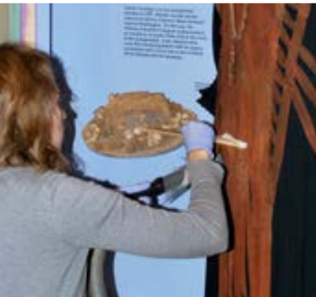
(Above & right) Exhibits were built, maintained, and moved throughout 2017...here's to another year of education and adventure!