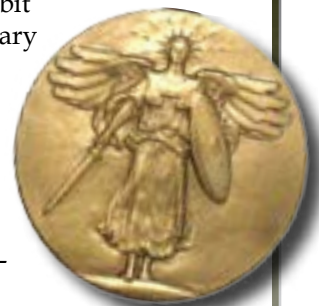
The WWI Victory Medal awarded to Americans who participated in the Great War

When America joined the war in 1917, the country – and Arizona – was unprepared for war. Patriotic spirit, however, ran high. With food prices escalating and rations in place, many people grew their own Victory gardens and learned how to can food. Women stepped forward to fill vacancies in the workforce, and were beneficiaries of the state's first minimum wage law. Citizens also bought war bonds and savings stamps.