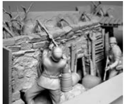
A miniature model of the exhibit's life-size trench diorama, yet to be built

When Curator of Collections Kylin Cummings first indicated that we should have this as part of the exhibit, we all thought: "When you've seen one trench, you had seen them all."