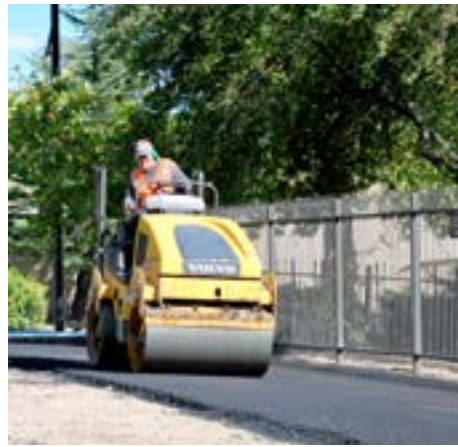
New pavement for the Summit St. parking lot!