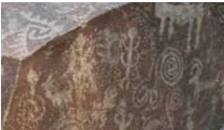
The ethnobotanical garden's petroglyphs are a star feature of the Museum grounds.